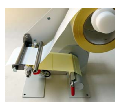
Label Threading Path

OPTIONAL LABEL COUNTER: The optional Label Counter will add one count to the displayed number for each label that is dispensed. This Option is available only factory installed in new units.