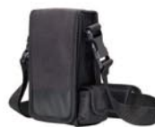
Belt holster with shoulder strap