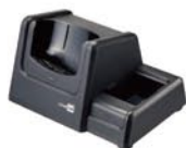
Charging and communication cradle